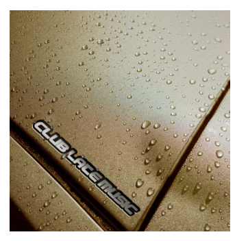
21.01.16 Japan Edition

14-track compilation w/ Blastto, Ultramiedo, MSTK, WRACK, Lil Crack and more