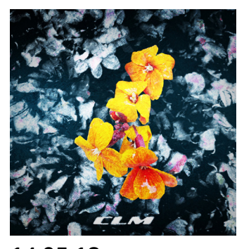
14.05.18 Machine Gun Compilation 36-track compilation w/ Blastah, Nahshi, Celes7e, Snowy Beatz, Wrack, Lil Mystic and more