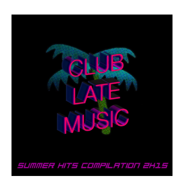
04.07.15 Summer Hits Compilation 2K15

9-track compilation w/ Miley Serious, DETENTE, AZN Girl, Ideal Corpus, Aamourocean and more