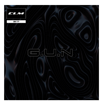
28.04.17 G.U.N Compilation

14-track compilation w/ Blastto, Ultramiedo, MSTK, WRACK, Lil Crack and more