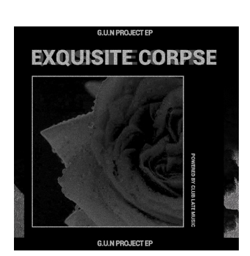
08.11.17 Exquisite Corpse Debut EP